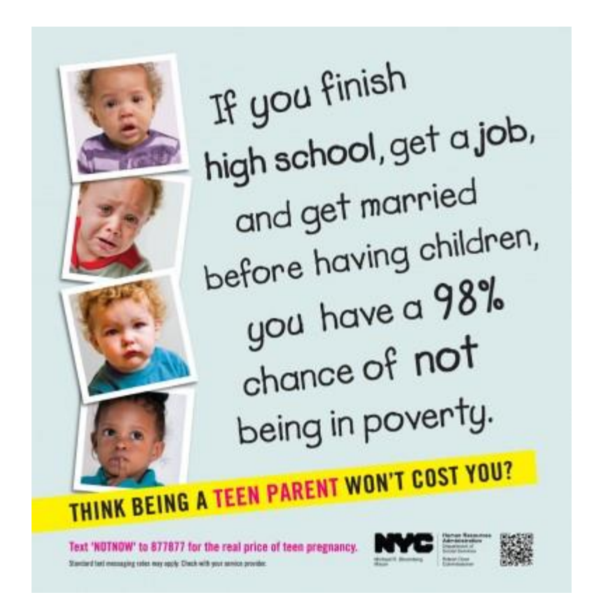
Source: New York City Human Resources Administration, Department of Social Services